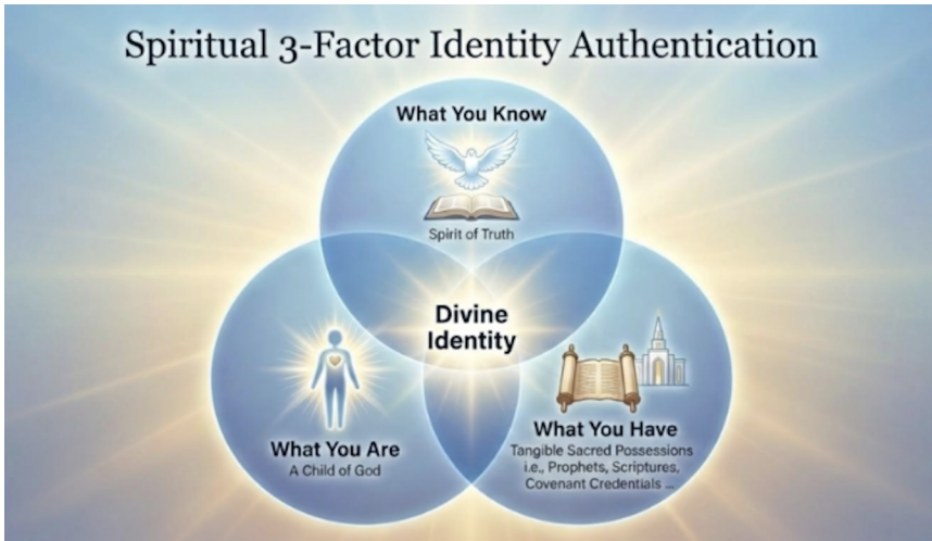
Diagram: Spiritual 3-Factor Authentication